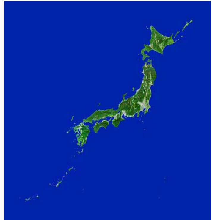
(After Color control & Mosaic)